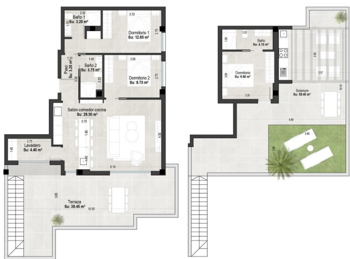
tabla de superficies