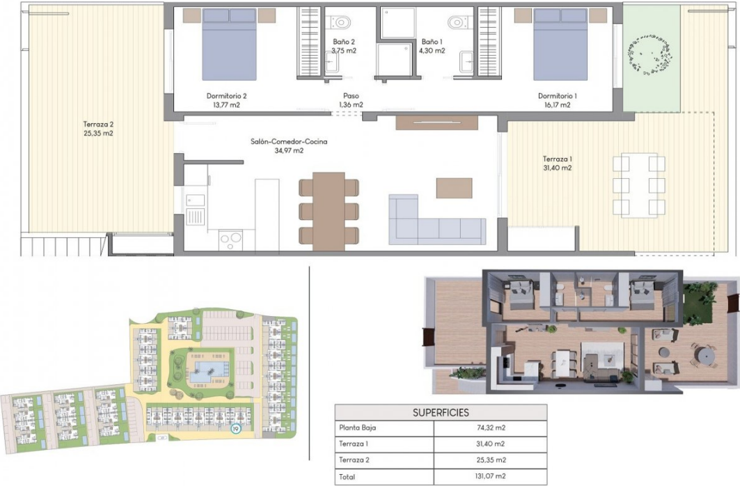
VIVIENDA n°- 19