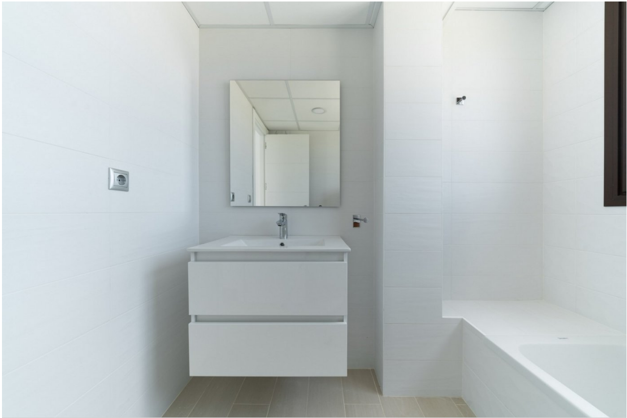
PLANTA PRIMERA - FIRST FLOOR