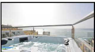
SPA en Villajoyosa Alfo.